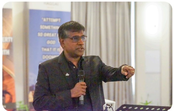
Speech at the Haggai National Consultation Forum