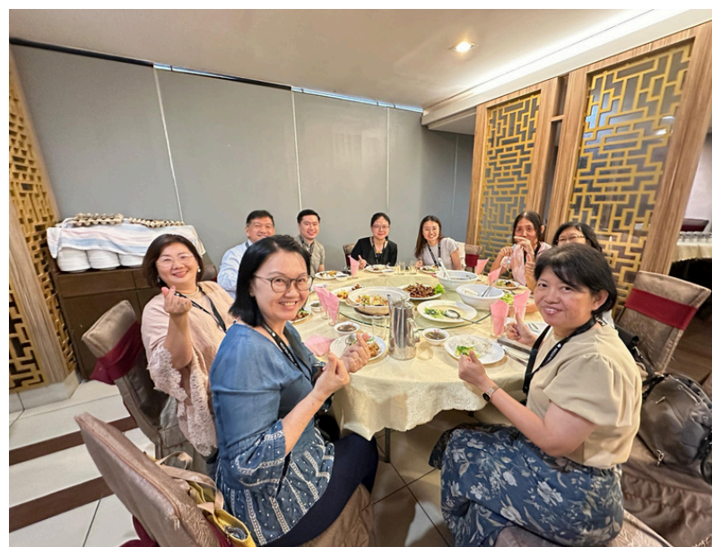
Participants having meals and fellowship together