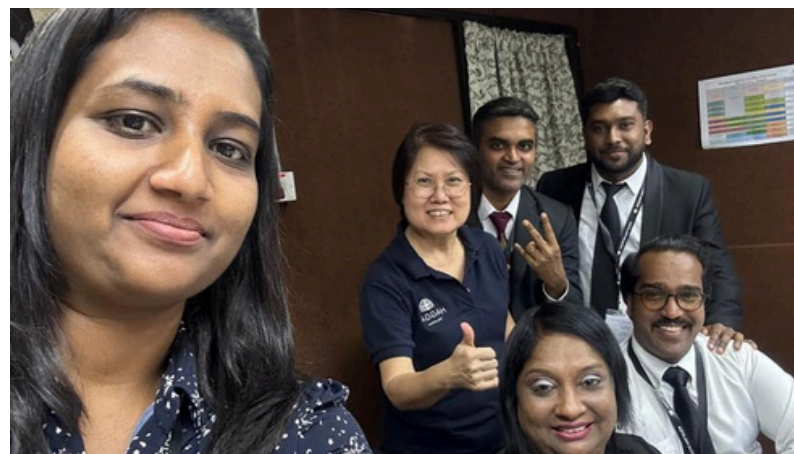
Shah Alam AA OC