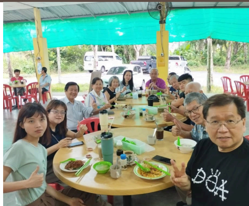
BMBCC OC from Bukit Mertajam