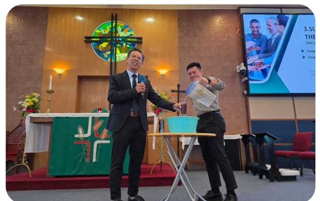
Preaching at St Andrew's Church, Brunei