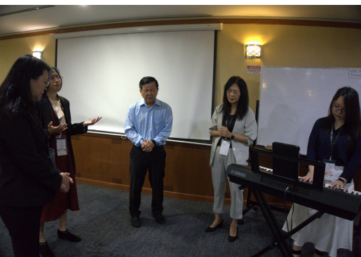
OC Team praying together