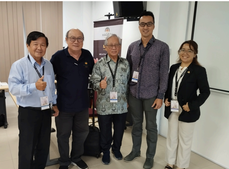
Time for renewing of friendships