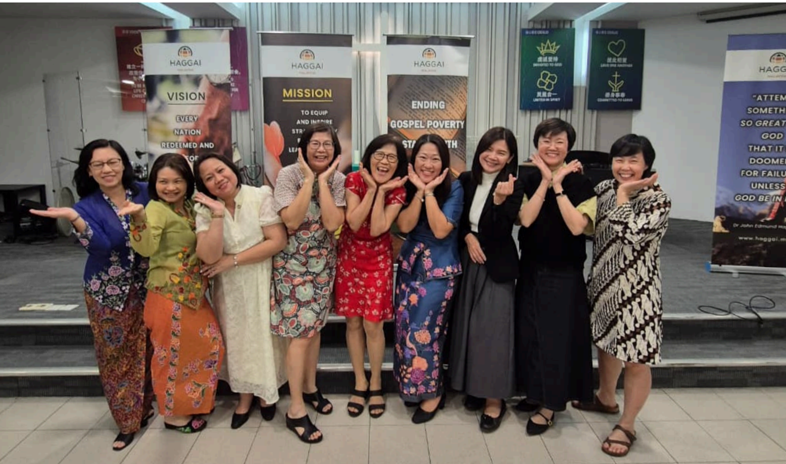
Haggai Women Leaders with radiant smiles, joyful hearts – shining for Christ together