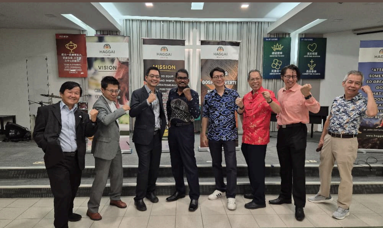
Haggai Men Leaders united for the Gospel and standing strong together