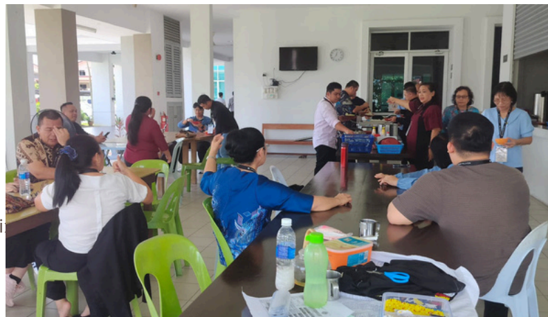
Good food for the participants, thanks to the Organizing Committee!