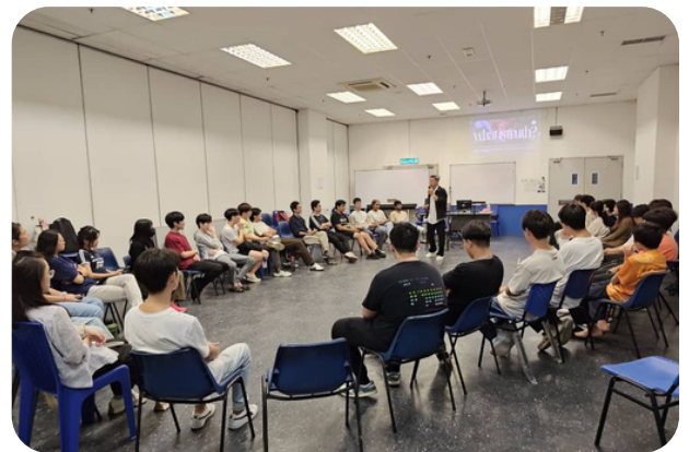
Passion to transform the Next Gen