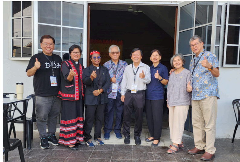
Partners in OA Ministry