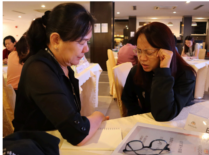
Participants praying for each other