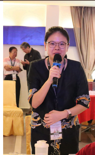
Participants sharing during sessions