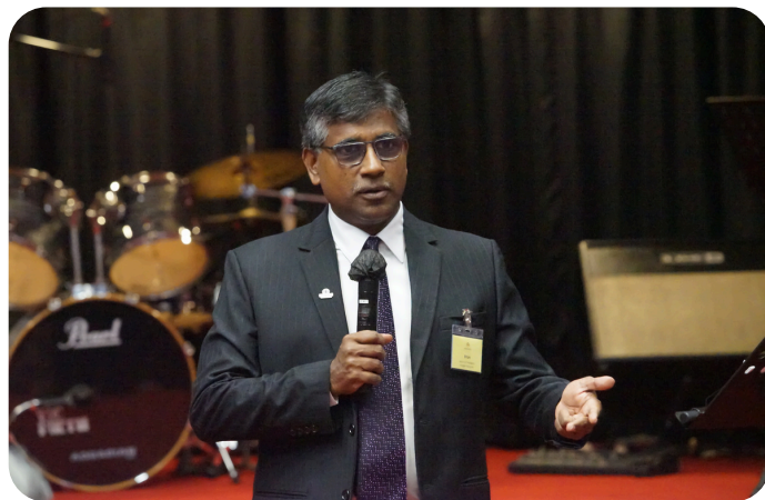
Opening address at Kingdom Alliance

United in purpose, serving with passion and commitment for greater Kingdom impact