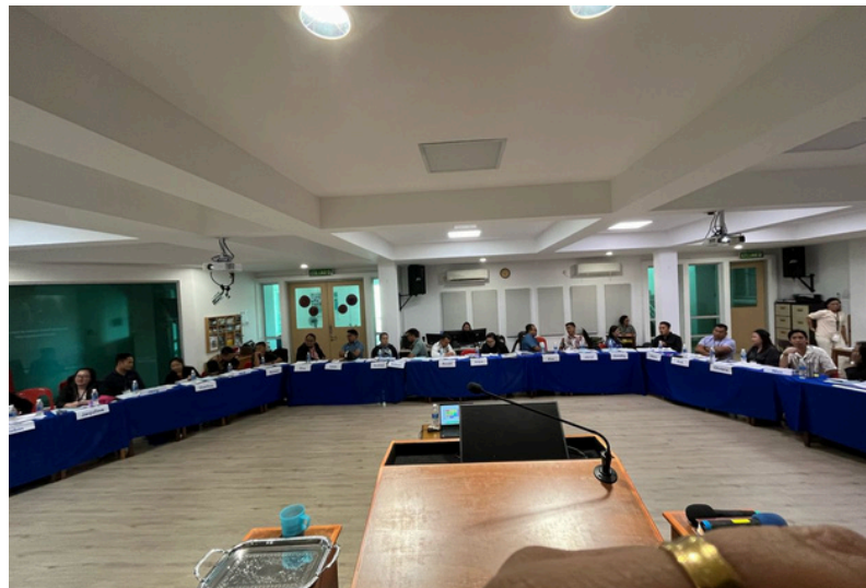
Cohort 2 session