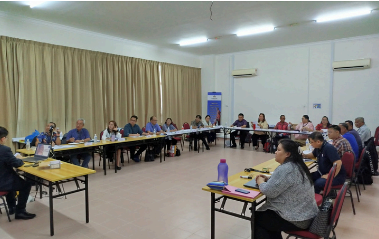
Excellent facilities at the Kidurong Anglican Centre