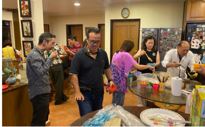
Everyone enjoying their share of the yummilicious food fare