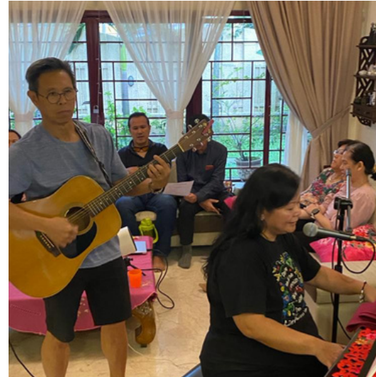
Time to worship together our Lord and Saviour Jesus Christ