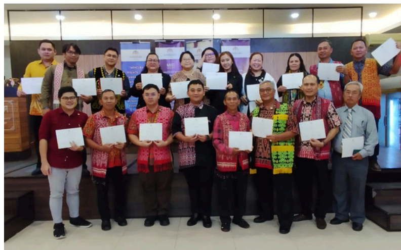
Congratulations to the 19 Alumni!