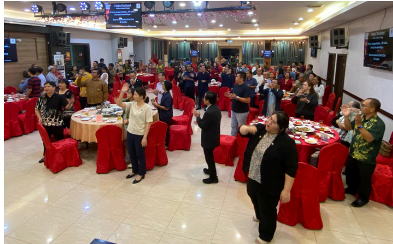
Graduation Dinner at Crown Dynasty Restaurant, 9 tables