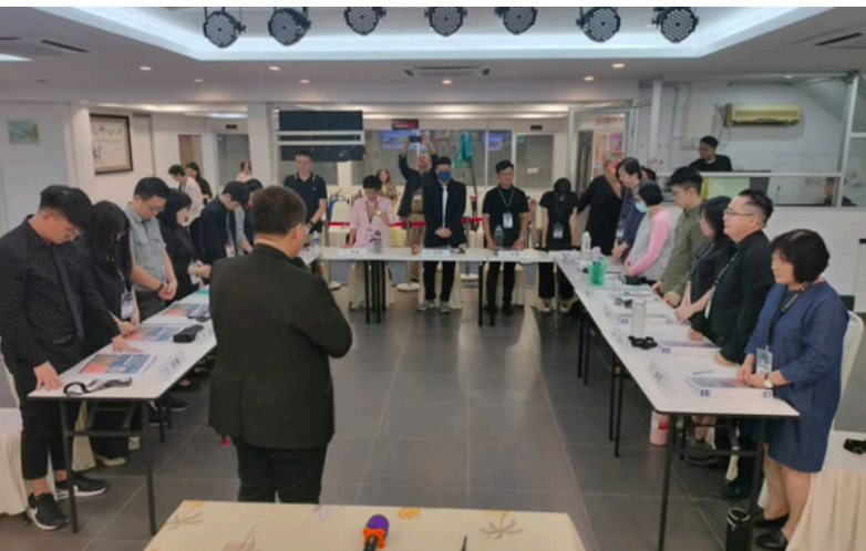
Committing the National Seminar to God