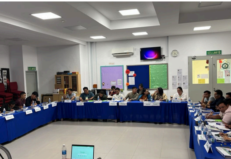
Cohort 1 session