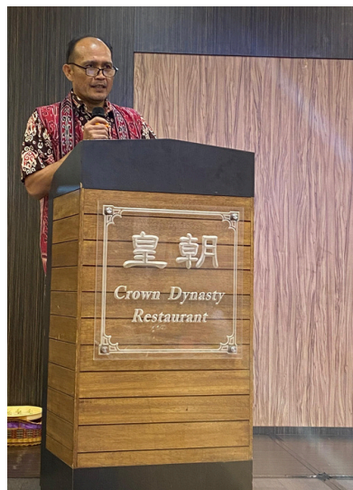
Participants sharing their Haggai Experience