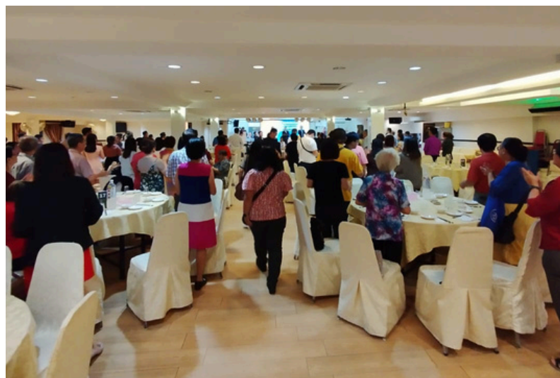
21 tables filled with Church Pastors and Leaders from Bukit Mertajam and Penang