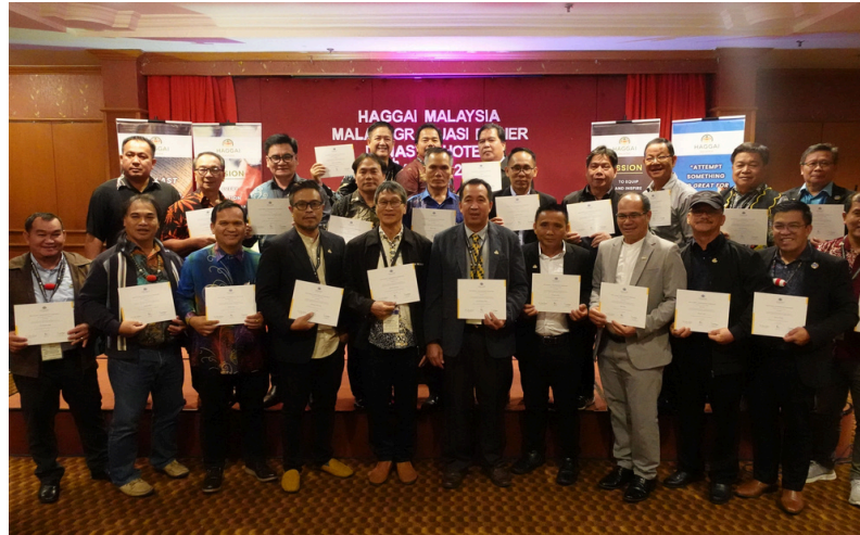
28 BEM Senior Pastors and District Superintendents