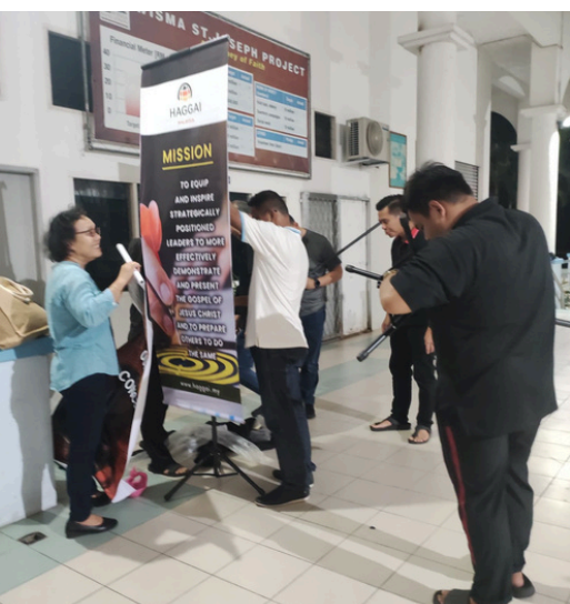
Setting up the venue

This is a sight to behold as it is unprecedented in Haggai Malaysia Seminars. The Mater Dei Church M2403 Residential Area Leadership Seminar was organized by Miri AA OC from 14 to 17 March 2024 with 152 Alumni graduates. All attendees are high school leavers preparing to go to colleges and universities. It was held at MDC premises and the participants stayed in the dormitories.