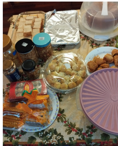
Abundance of yummilicious food of pot bless - thanks to all for your contribution!