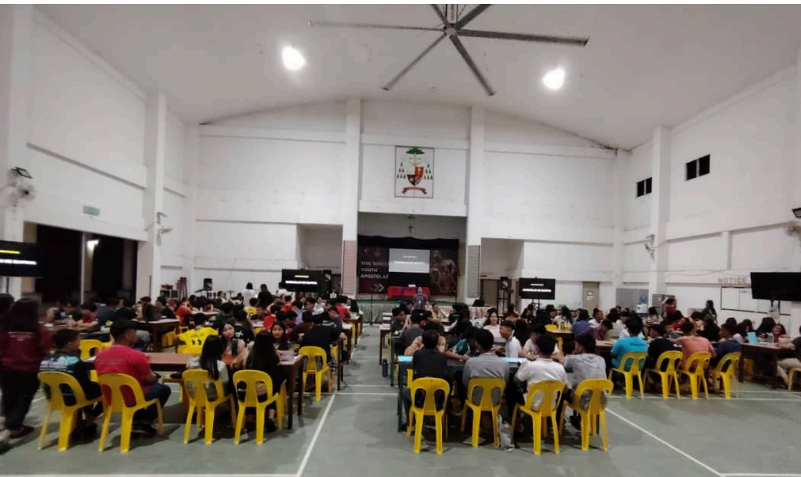
The cohort was divided into many groups to facilitate small group discussion