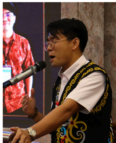
Participants sharing their Haggai experience during the Graduation Dinner