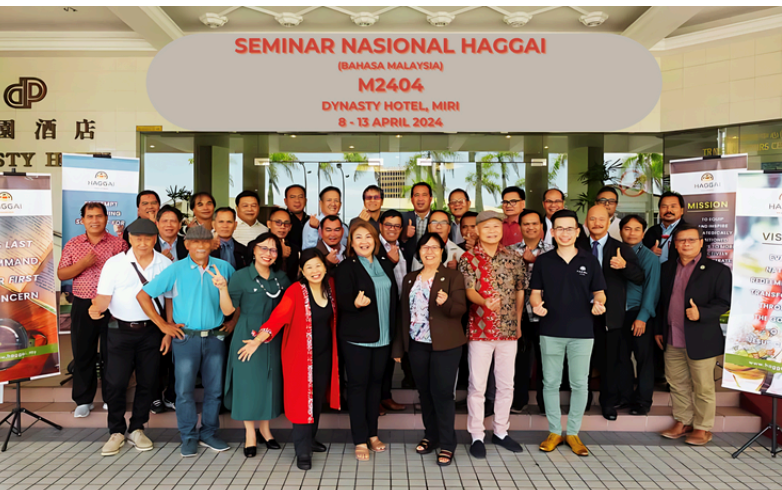
Miri AA Organizing Committee

The BEM M2404 Residential National Seminar was organized by Miri AA for BEM Sarawak Senior Pastors and District Superintendents who oversee multiple BEM Churches. It was completed on 13 April 2024, with 28 Alumni graduates. It was held at Dynasty Hotel, Miri. Expenses used from the Gala Dinner Fund to sponsor this NS is RM22,400.